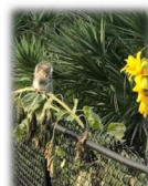
The squirrel was named Judas because he steals our sunflower seeds and tomatoes