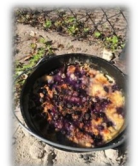
Yummy Blueberry Cobbler made in the Garden